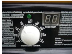
Built-in thermostat with digital temperature indicator