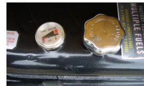
Tank level meter