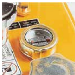
VAL with fuel level indicator. (Not on VAL 6 KB.)