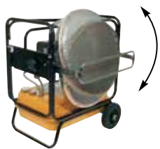
Vertical inclining with locking mechanism.