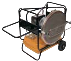
Folding push bar VAL MIDI.